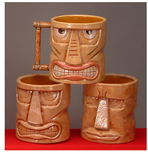
#TK-103 Pensive Tiki #TK-102 Anguish Tiki #TK-101 Anger Tiki #TK-104 Disgust Tiki #TK-105 2 Tiki Handles

(Tiki on top with handles is TK-101) Each mug holds approximately 24 oz.