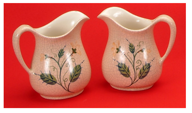
#906 <u> 2 Small Pitchers </u> 8 fl. Oz. - 5 x 5"

Each of these shapes is plain with no detail on the outside. Surfaces are smooth for your own design or decals.