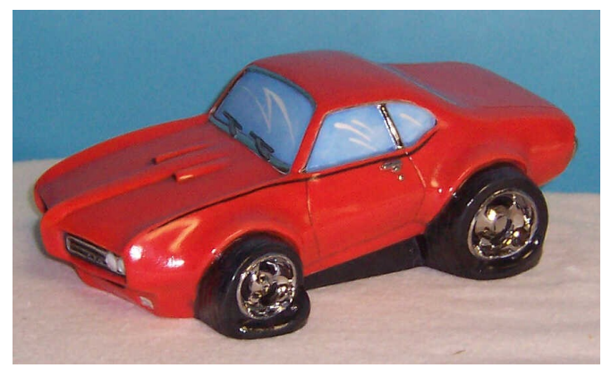
#1401 <u>'69 Goat</u> 8.5" L