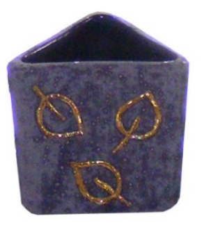
#CS-174 3" Triangular Votive Cups 2 per mold