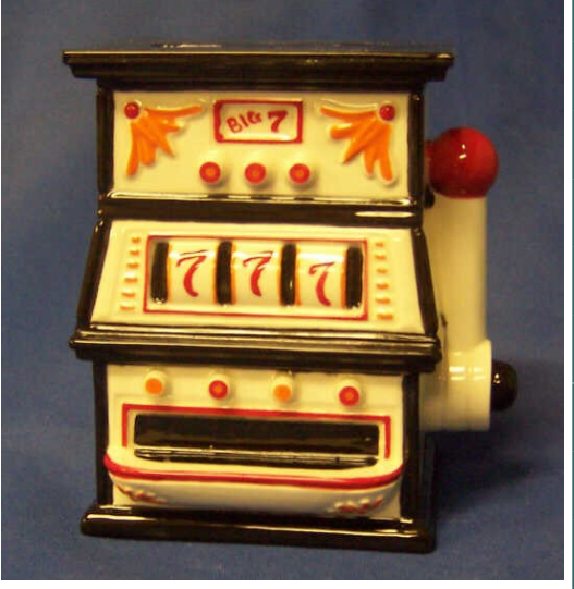
#CS-177 Slot Machine Bank 5"x 4"x 3"