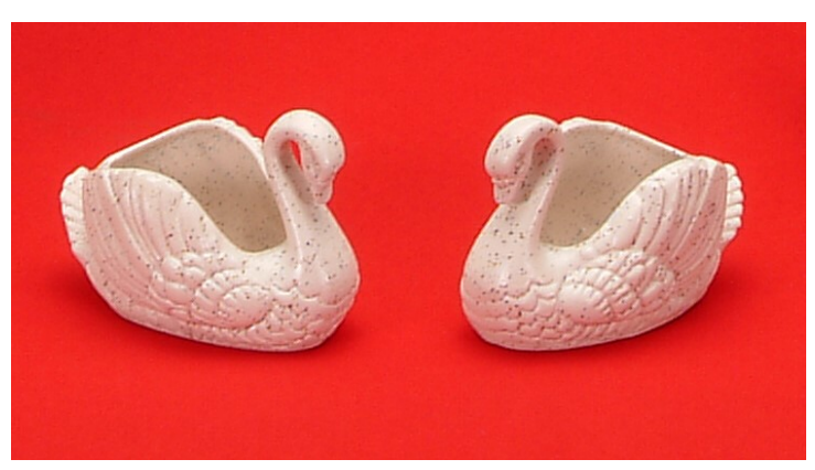
#904 Set of 2 Swan Wedding Favors 2.5 x 3.5"