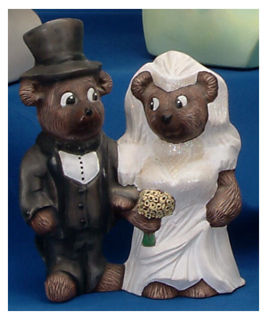
#901 Wedding Bears 6 \times 4 \times 2 "