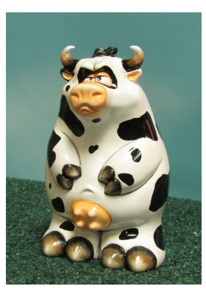
#CS-185 <u>Mad Cow</u>