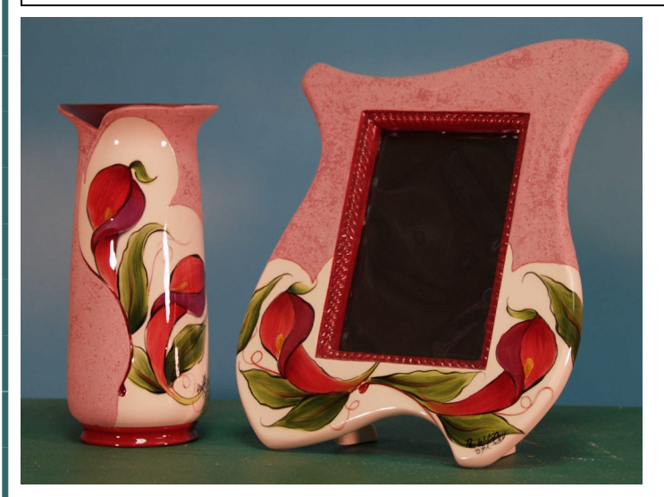
#1700 <u>Floral Vase</u> 9" T #1701 5x7 Picture Frame 10x7"

items from molds #1704—#1708, or #1712—#1715.