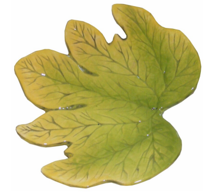
#1845 <u>Leaf Saucer</u> 6 x 6-1/2"