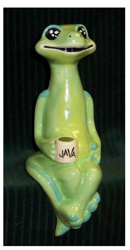
#CS-184 <u>Small Sitting Gecko</u> 6" T

Small Gecko Hats CS-150 Small Cheese Wedge CS-156 Santa Hat & Top Hat CS-157 Sombrero & Cowboy Hat CS-158 Straw Hat & Ball Cap