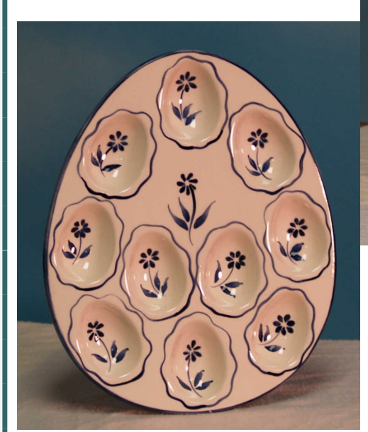
#1825 Egg Tray 9 x 11"