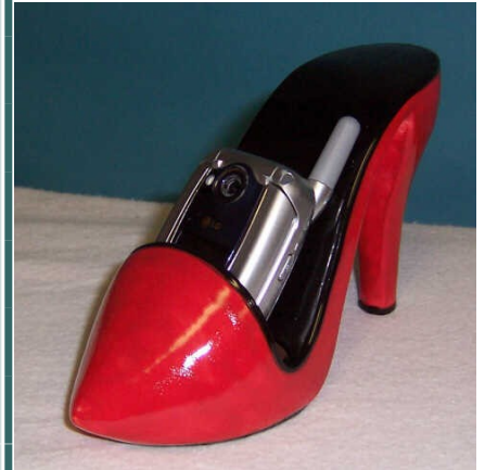
#CS-138 <u>High Heel</u> Cell Phone Holder 6"x 3"x 4"

#CS-143 <u>Video Game</u> <u>Cell Phone Holder</u> 4" x 6"