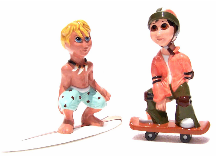
#CS-103 Sports Kids 6" Both in same mold