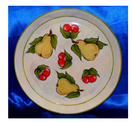
#CS-146 <u>Large Charger Plate</u> 13" diameter