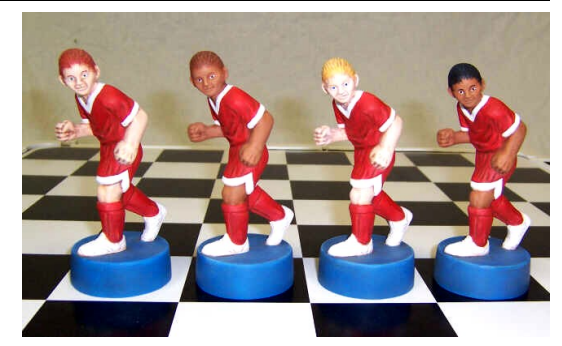
#1302-S \underline{\textbf{4 Girl Pawns}} 5" Players