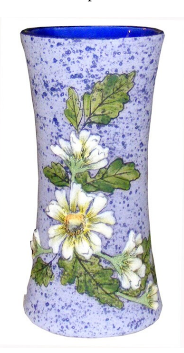
\begin{array}{cc} \text{\#CS-171} & \underline{\textbf{Hourglass Vase}} \\ & 7 \end{array}