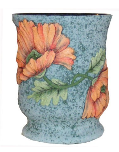
#CS-172 Hurricane Pot 6 x 4.5"