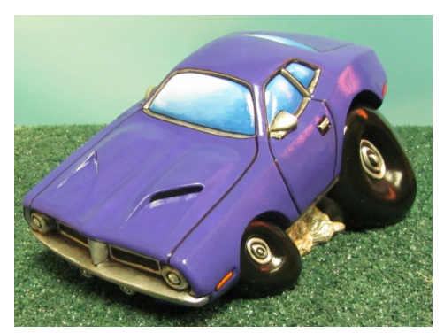
#1409 <u>Hemi 'Cuda</u> 9"L