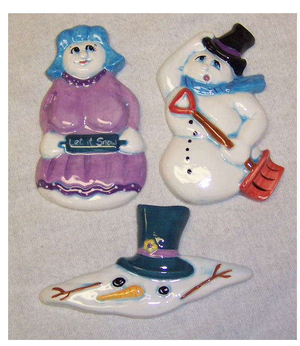
#RO-104 Set of 3 Snowmen Ornaments 4.5"