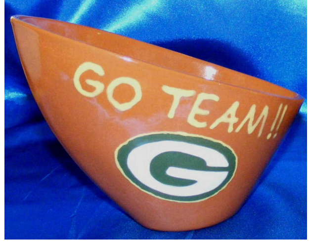
#CS-149 <u>Football Bowl</u> 7 x 5 x 6"