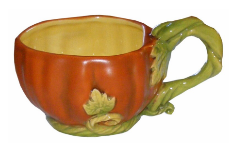
#1844 <u>Pumpkin Teacup</u> 2 x 5"