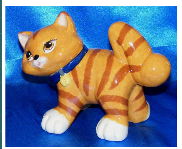
#CS-119 <u>Curious Kitten</u> 5" x 6.5"