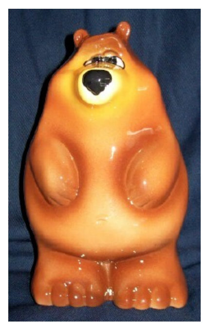
#CS-163 Standing Bear