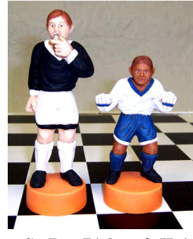
#1301-S <u>Boy Bishop & Knight</u> 6" Referee—5" Goalie