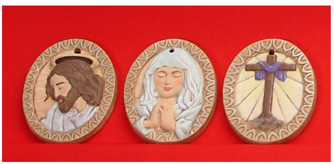
#RO-101 <u>Jesus</u> 3 \times 2 "