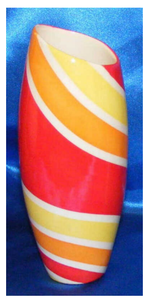
#CS-145 <u>Slant Top Vase</u> 7.5" T