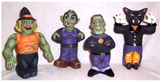
Halloween Stackers: 6" T Mix and match the interchangeable pieces to make your favorite monster!

#F-105 A Monster Heads #F-105 B Witch & Cat Bodies #F-105 C Frankenstein & Dracula Bodies