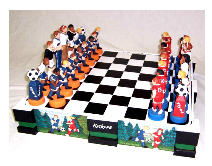
Complete Co-Ed Soccer Chess Set