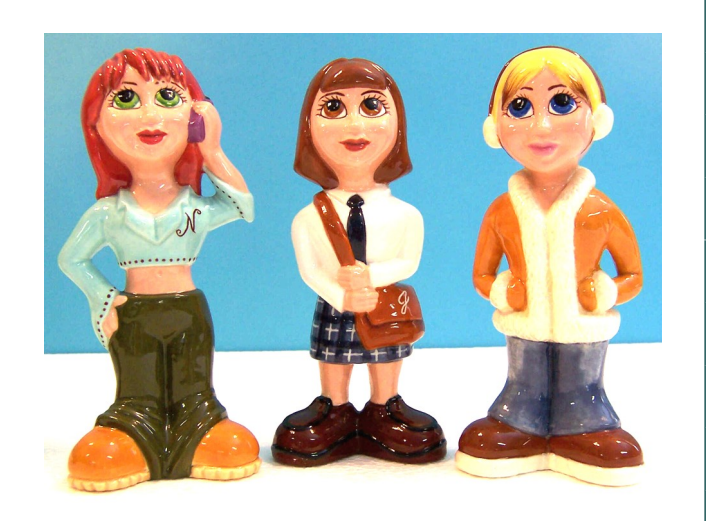
#CS-102 <u>Fashion Friends</u> 6" All 3 in same mold