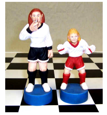
#1303-S <u>Girl Bishop & Knight</u> 6" Referee—5" Goalie