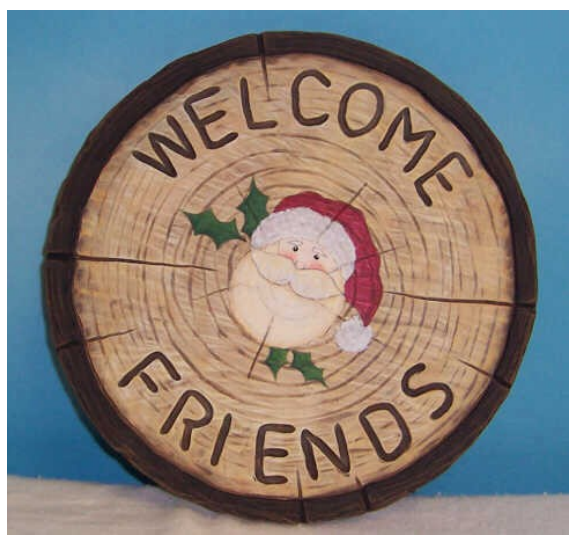
#MM-100 Welcome Friends Plaque 10" Diameter Plain center for your own design

#1701 <u>5x7 Picture Frame</u> 10x7" Both items are plain. You can either paint on your own design or add