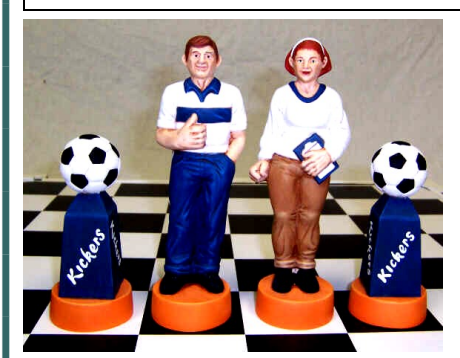
#1300-S <u>King, Queen, 2 Rooks</u> 7" Coaches—4.5" Rooks