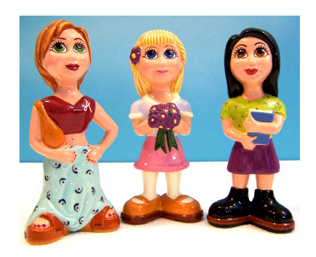
#CS-101 <u>Fashion Friends</u> 6" All 3 in same mold