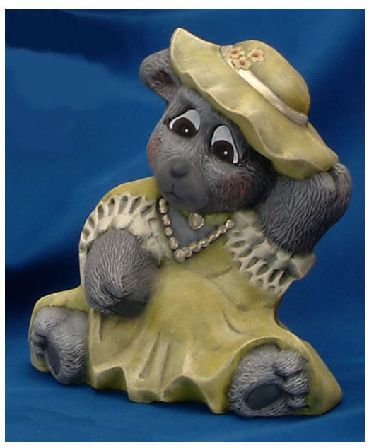
#902 Southern Belle Bear 6 \times 6 \times 5 "