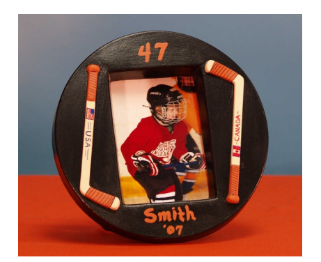
#CS-132 Hockey Frame

Each round frame is 7" in diameter and holds a 3x5" picture.