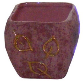
#CS-167 <u>Square Dish</u> 4" x 4"