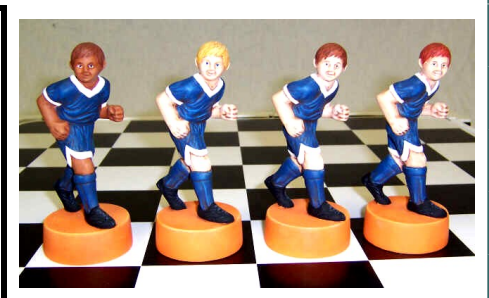
#1304-S <u>4 Boy Pawns</u> 5" Players

All Girls Team All Boys Team Mixed Co-Ed Team