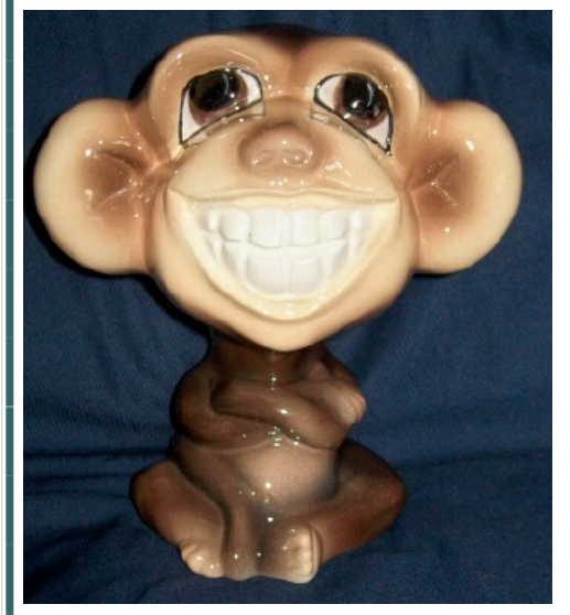
#CS-161 <u>Funky Monkey</u>