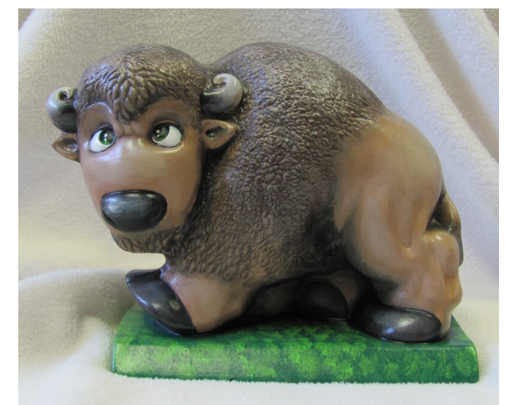
#CS-186 <u>Bison</u> 6" x 8"