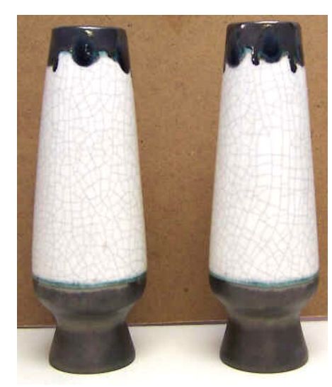
#CS-106 Retro Vase 2 per mold