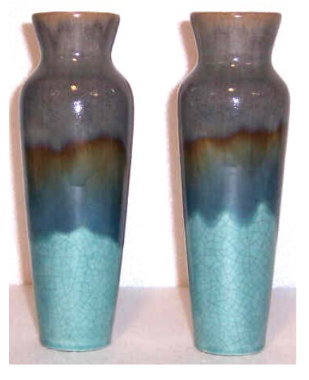
#CS-107 Contemporary Vase 2 per mold