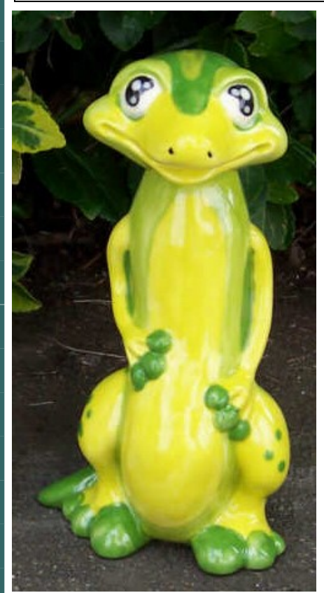
#CS-127 Small Gecko 6" T