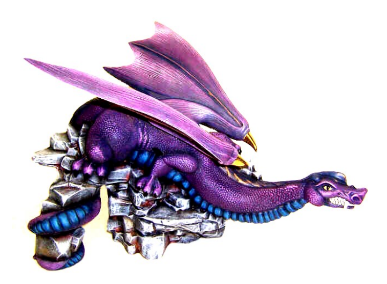
#F-106 A/B \frac{\text{Dragon on the Prowl}}{10 \text{ x } 7 \text{ x } 14\text{"}}

#F-102 The Sorceress 8 x 4 x 3" #F-104 Gnarly Tree Stump Base 4 x 5 x 4"