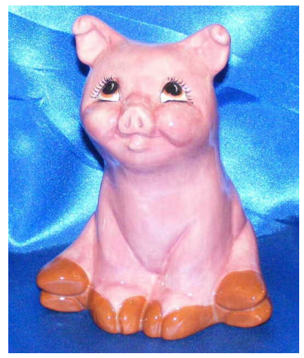
#CS-126 Sitting Piggy