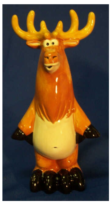
#CS-164 <u>Standing Deer</u> 8-1/2"