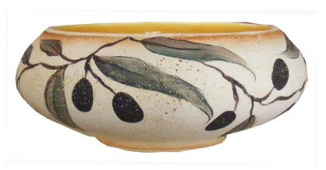
#CS-173 Round Bowl 4" T x 9" diameter