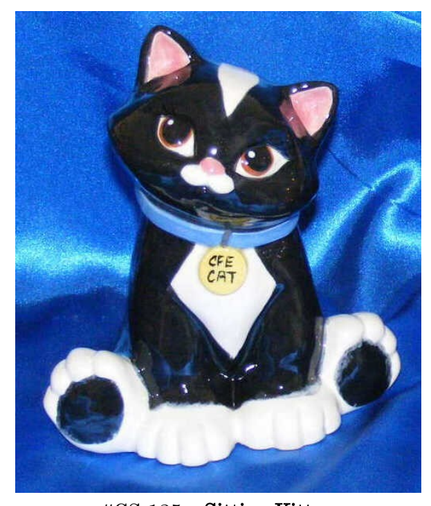
#CS-125 Sitting Kitten 6" x 5.5" Can be used as a bank