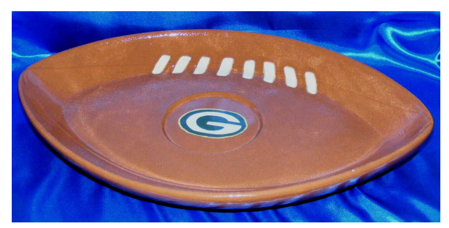
#CS-130 <u>Football Serving Tray</u> 12 \times 18 "