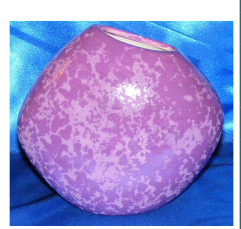
#CS-142 Sioux Pillow Vase 6 x 7"