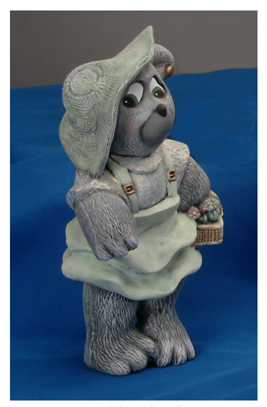
#903 <u>Victorian Bear</u> 8 \times 4 \times 3 "

#901 can be used as a cake topper #902 & #903 can be used as a bank