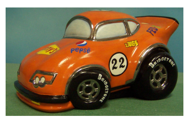
#1408 <u>Racecar</u> 8"L