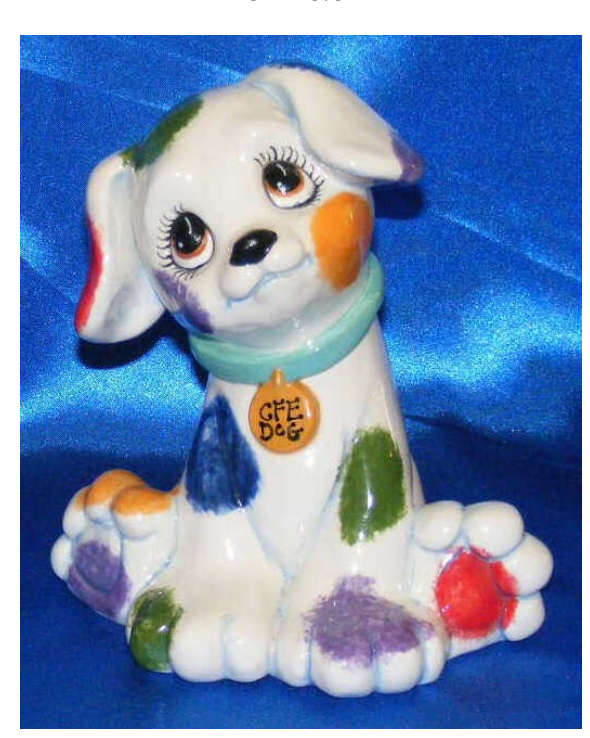
#CS-124 Playful Puppy 6" x 5.5" Can be used as a bank