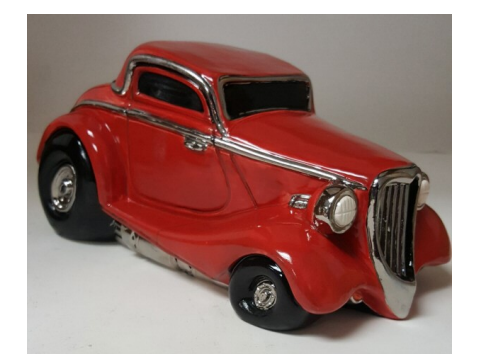
#1410 Roadster 9 1/2" L

Can be used as a bank - Works well as a trophy or lamp base Great for any Car Enthusiast