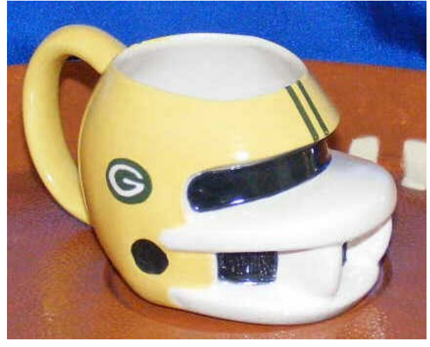
#CS-129 Helmet Mug/Cup 3 \times 5 " Use with or without the included handle