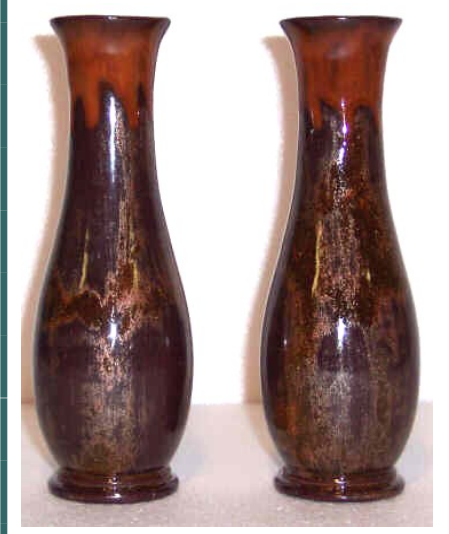
#CS-105 Classic Vase 6.5" 2 per mold