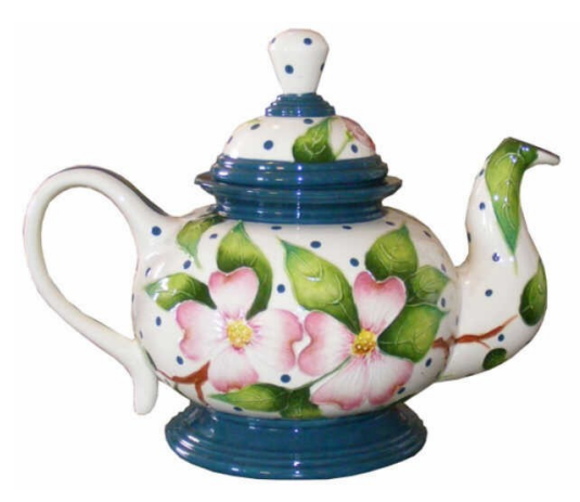
#CS-162 A/B Stout Teapot with Lid 9.5" T x 11" L (Painted design is not part of mold)