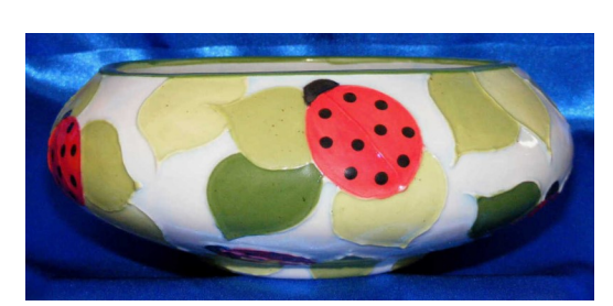
#CS-147 Round Bowl 7" diameter