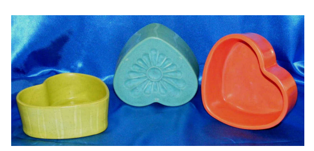
#CS-148 Heart Bowl 6 \times 2 "