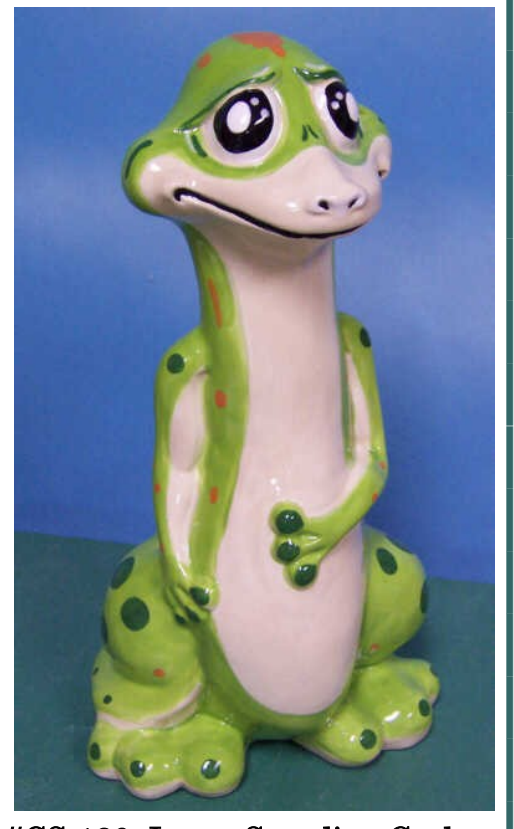
#CS-139 <u>Large Standing Gecko</u> 15" T Makes a great bank!