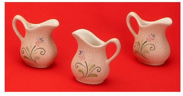
#905 <u>3 Toothpick Pitchers</u> 4 fl. Oz. - 3 x 3"