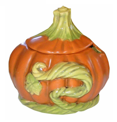
#1847 A/B Pumpkin Sugar Bowl & Lid 4-1/2 \ge 5 "