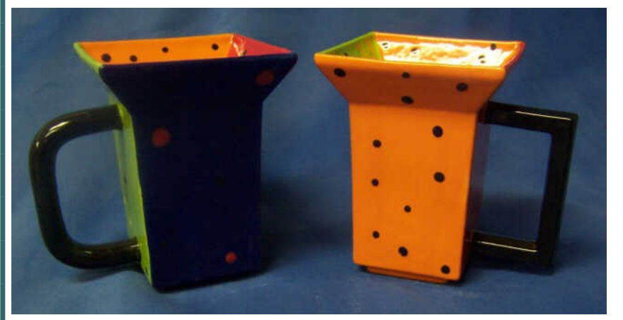
#CS-180 <u>5" Square Cup</u> (2 shown) #CS-182 <u>Universal Cup Handles</u> (2 per mold)