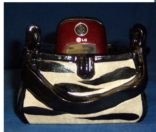
\begin{array}{cc} \text{\#CS-166} & \underline{\textbf{Purse}} \\ \underline{\textbf{Cell Phone Holder}} \\ 4\text{"} \times 5\text{"} \end{array}