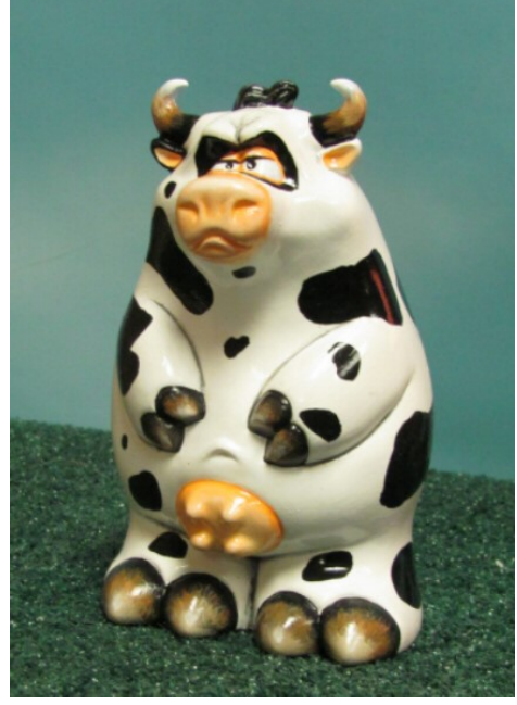
\begin{tabular}{ll} \#CS-185 & \underline{\textbf{Mad Cow}} \\ 6" & \end{tabular} \label{eq:mad-cow}