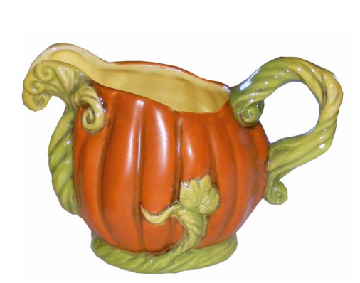
#1846 Pumpkin Creamer 4 \times 5 "