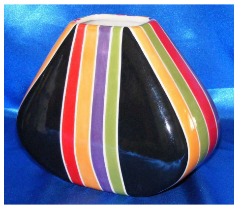
#CS-141 Navajo Pillow Vase 6 x 7"