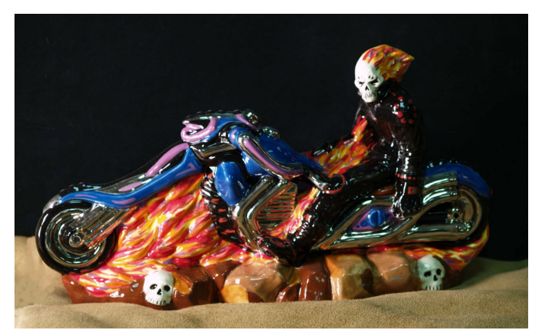
#F-107 Speed Demon 6 \times 12 "