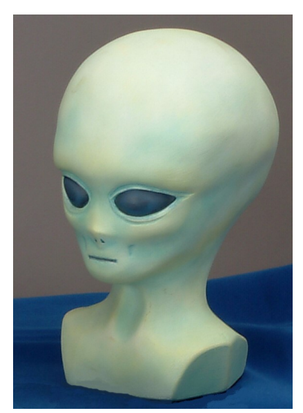
#A-51 <u>Alien Bust</u> 10"

#F-105 D Witch & Cat Legs #F-105 E Frankenstein & Dracula Legs