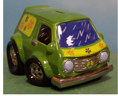
#1407 Movin' Groovin' Van7" L