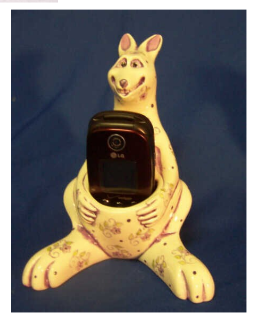
#CS-165 <u>Kangaroo</u> <u>Cell Phone Holder</u> 7"x 6.5"