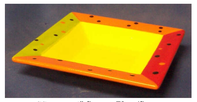
#CS-179 6" Square Plate/Saucer