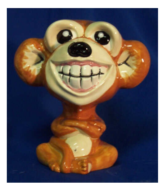
#CS-161 <u>Funky Monkey</u> 7"