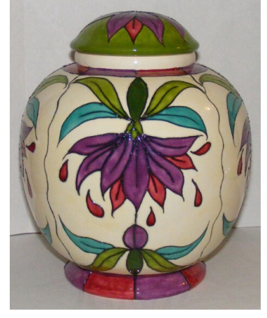
#1813 AB <u>Cayman Urn/Jar</u> 10" T x 8" W—26.5" circumference