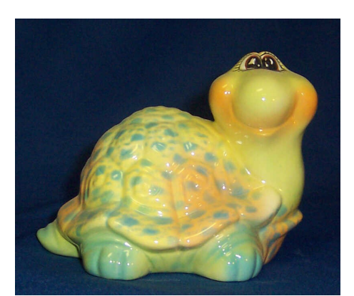
#CS-134 <u>Turtle</u> 4.5 x 5.5"

All of these designs make great banks ex cept CS-127 and CS-133.