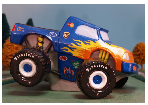
\begin{array}{cc} \#1403 & \underline{\textbf{Monster Truck}} \\ & 10 \text{" L} \end{array}