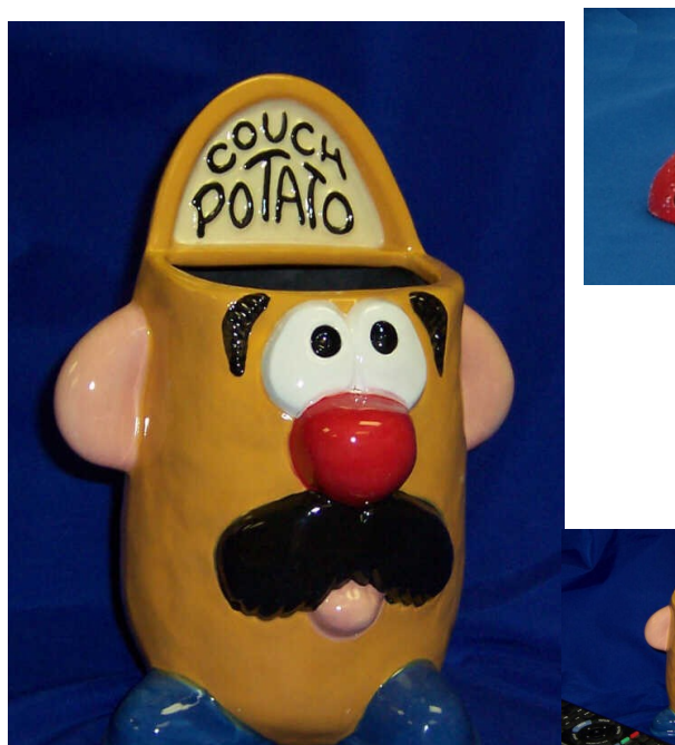
#CS-183 Couch Potato Remote Control Holder 7"

#1800 Farmhouse Plaque 4 x 4" #1801 Barn Plaque 4 x 4" #1802 Lighthouse Plaque 4 x 4" #1803 Church Plaque 4 x 3"