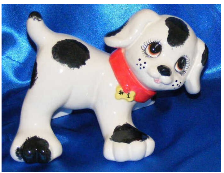
\begin{tabular}{ll} \#CS-120 & \underline{\textbf{Playful Puppy}} \\ 5" & x & 6.5" \end{tabular}