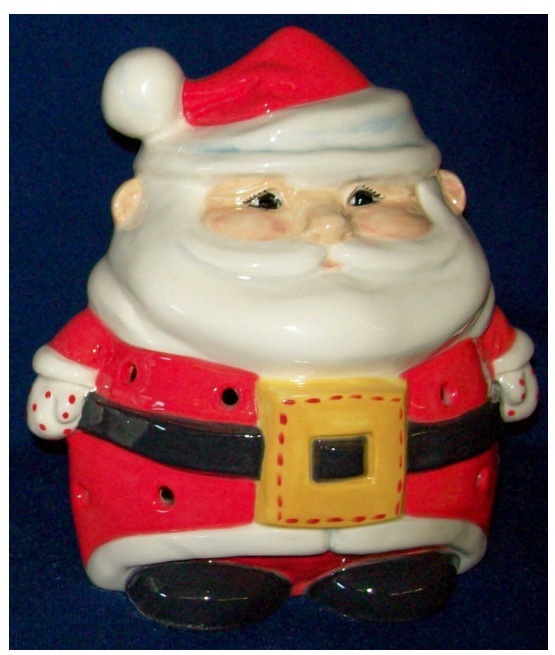
\begin{array}{ccc} \text{\#CS-}121 & \underline{\textbf{Santa Candleholder}} \\ & 6.5\text{"} \times 5.5\text{"} \end{array}