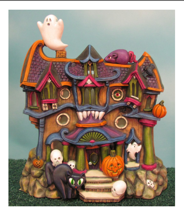
#F-108-Haunted House . 11" x 11" x 3.5"

The two accessory molds can be attached in many different configurations: