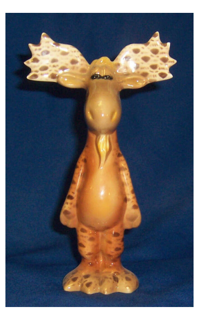
#CS-133 Standing Moose 8.5"

All of these designs make great banks ex cept CS-127 and CS-133.