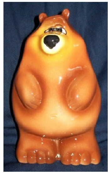
#CS-163 <u>Standing Bear</u>