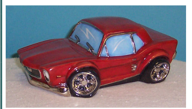
#1400 Classic 'Stang 8" L