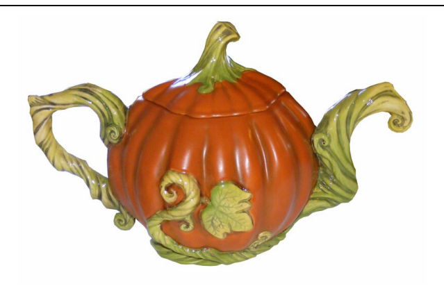
#1843 A/B Pumpkin Teapot & Lid 7-1/2 \times 12 "