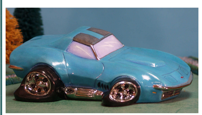
#1402 <u>Vicious Vette</u> 8.5" L