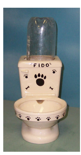
Designed for small to medium sized dogs and virtually any cat, the Pooch Pot measures 10" tall, 12" deep and 7" wide.

Now your pet can have a refreshing drink of water any time of the day! The cool part about this is that the toilet bowl refills itself automatically as your pet drinks! It uses a typical 2-liter soda bottle so you can recycle some plastic too! Your pet and the planet will thank you for buying this mold! We know your pet likes to drink from the toilet anyway, so now he can do it all day long and still give you a big kiss when you come home!