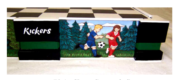
#1306 Plain Chess Corner & Center 4" T—for multiple chess sets