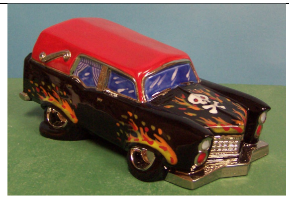
\begin{array}{c} \text{\#}1406 & \underline{\text{\textbf{Hot Rod Hearse}}} \\ 10.5\text{" L} \end{array}