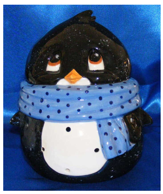
\begin{array}{c} \text{\#CS-123} \ \ \underline{\textbf{Penguin Candleholder}} \\ 6.5\text{"} \ x \ 5.5\text{"} \end{array}