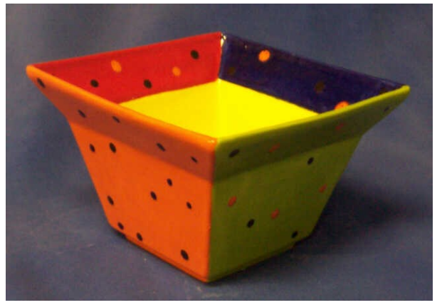
#CS-181 <u>4" Square Bowl</u>