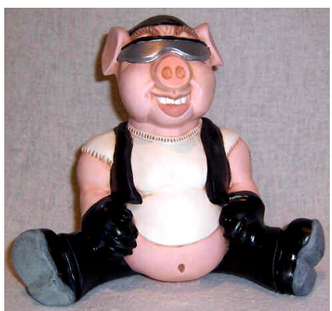
#CS-113 <u>Biker Pig</u> 8 x 7"