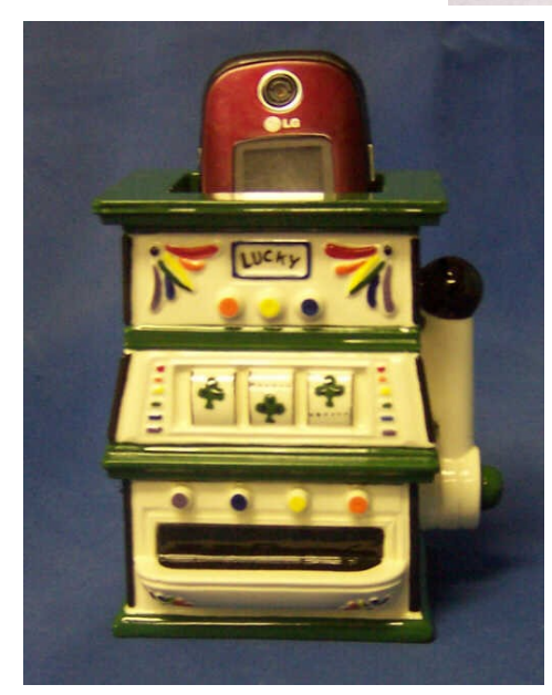
#CS-178 Slot Machine Cell Phone Holder 5"x 4"x 3"