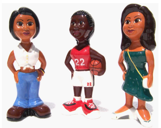
#CS-104 Ethnic Girls 6" All 3 in same mold