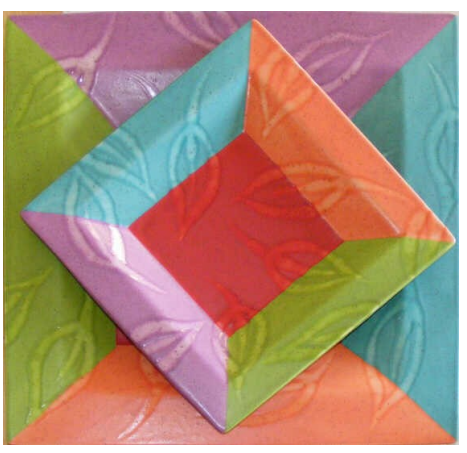
#CS-159 <u>12" Square Plate</u> #CS-160 <u>8" Square Plate</u>