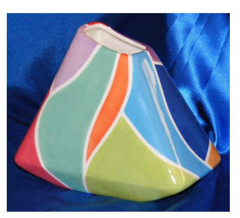
#CS-140 <u>Apache Pillow Vase</u> 6 \times 7 "