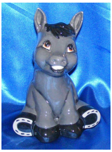
#CS-128 Sitting Donkey