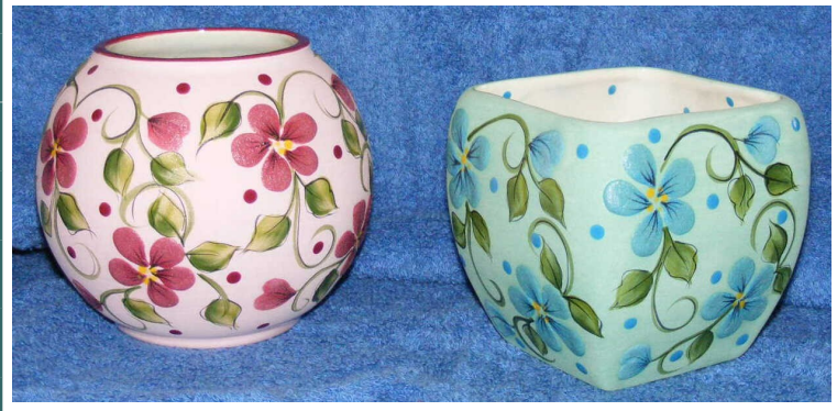
\begin{tabular}{ll} \#CS-168 & \underline{\bf Small~Globe} \\ 4.5" & x~5" \end{tabular}