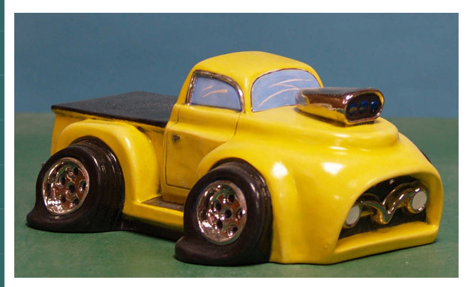
#1404 Street Rod Pick-up 9.5" L