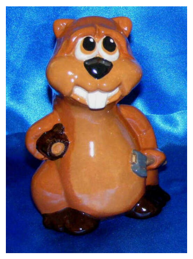
#CS-131 Beaver w/ Hatchet 6"